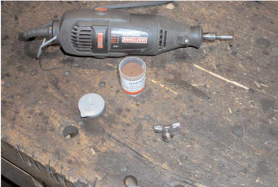
Center section cut out.