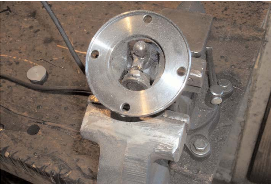
One side cut, time to cut the other side and remove the center section.