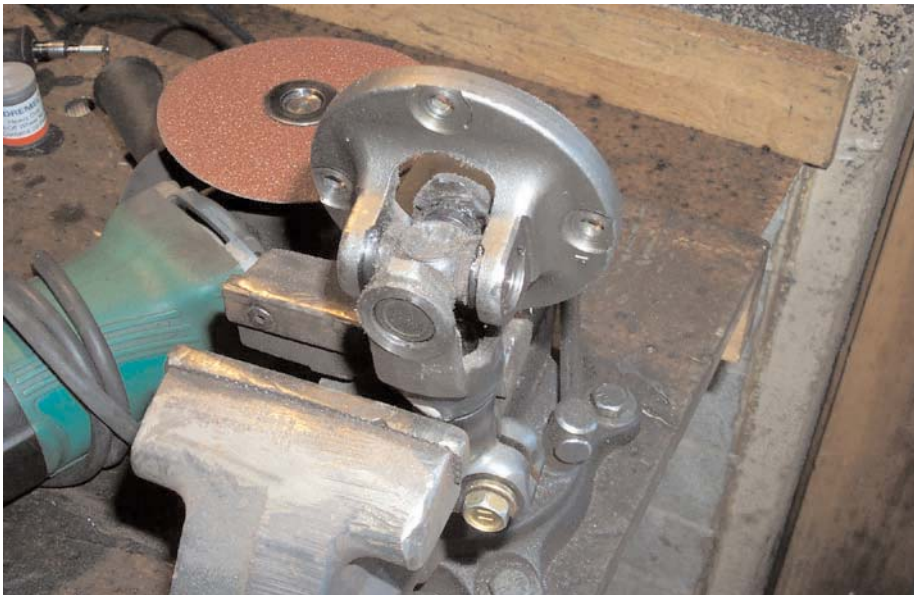
Using a grinder with a sanding disc and rubber backer plate, smooth out the top of the ears.