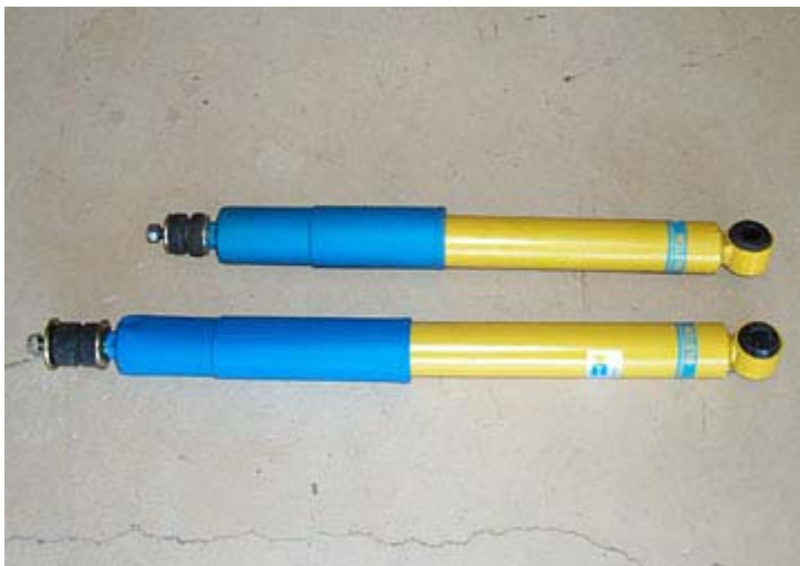
Bilstein BE5-2451 , 4Runner (top) Bilstein B46-1478 , Land Cruiser (bottom)