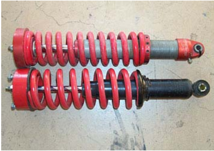
Sway-A-Way Race Runner and Old Man Emu N91S (painted black). Both are the extended length design.