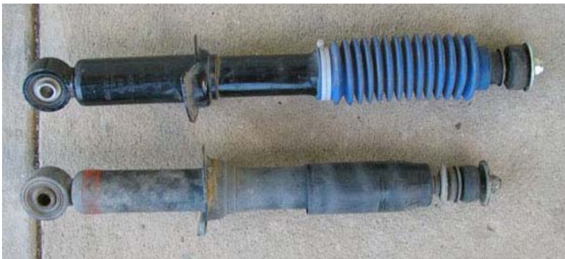
Tough Country Tacoma Shock (Top) with ball joint lower mount and Stock 4Runner Shock Bottom