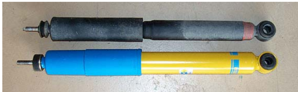
Stock 4Runner rear shock and Bilstein BE5-2451 rear shock.

*Requires custom mounting. Both ends are round holes.