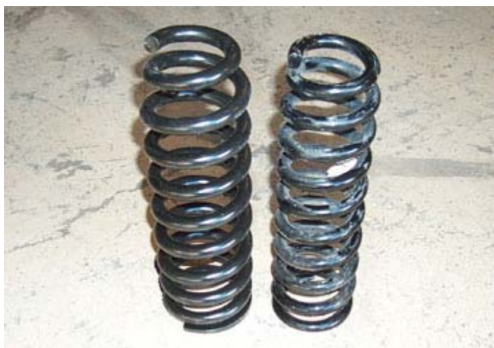
Tundra coil on the left and Old Man Emu 881 on the right. You can see they are the same height but the Tundra coil has a thicker wire.