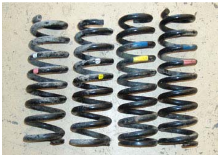
2001 coils are white/pink and white/yellow, the 1999 coils are blue/yellow and blue pink.