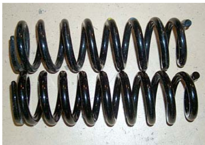
1998 Coil on top, 1999 Coil on the bottom. Both are from V6, 4WD and 16" wheel trucks. You can see the 1999 coil has 9 winds and the 1998 coil has 8.