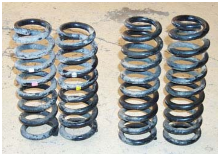
Here you can see the difference in height in the 8 wrap 2001 coils and the 9 wrap 1999 coils.