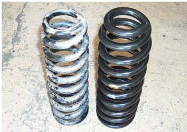
1999 4Runner coil left and Tundra TRD 4WD coil right. The two coils are the same height but the Tundra coil has a thicker wire.